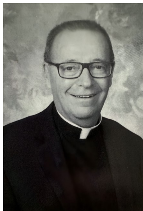
2015 New Spectacles