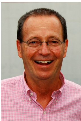
2010 Very Casual