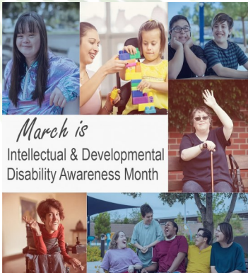
March is Intellectual & Developmental Disability Awareness Month