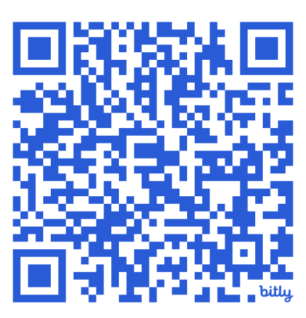
Scan QR to register and view the conference flyer.

WHERE: St. Albert the Great Church and Parish Life Center 6667 Wallings Road North Royalton, OH 44133 440-237-6760 CONFERENCE QUESTIONS: Call 216-312-4172