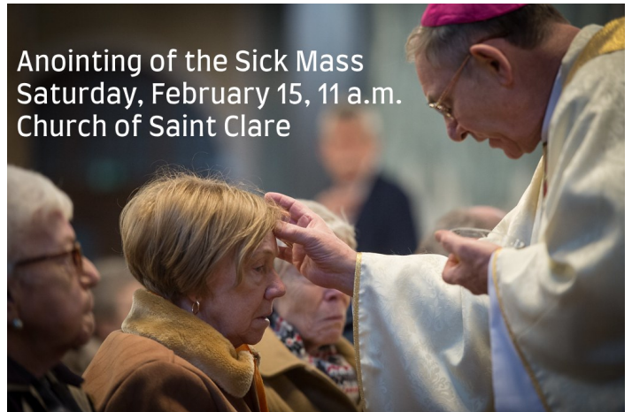
Anointing of the Sick Mass Saturday, February 15, 11 a.m. Church of Saint Clare