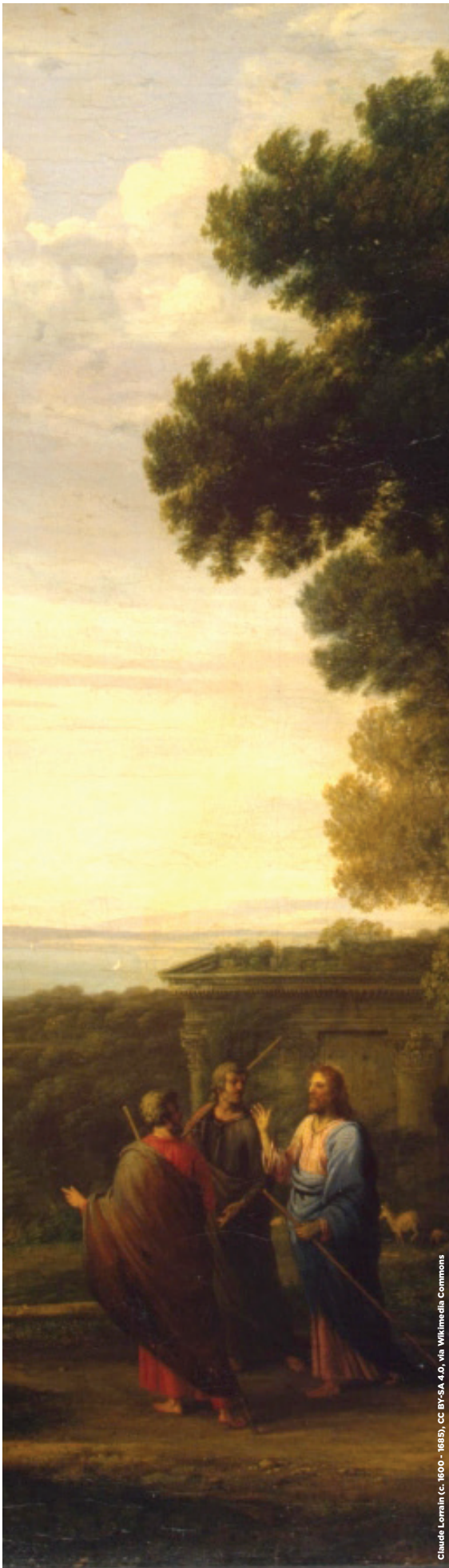
Claude Lorraine (c. 1600 – 1682)

ACCOMPANY How can we imitate Christ in the way he reached out to his disciples who were wracked with fear and doubt? Perhaps we know somebody who feels trapped by sin, or unworthy of good things, or a constant failure. Let's be honest, sometimes that person is us! We all need encouragement and accompaniment from time to time. Find a way to be that encouragement for someone this week who's having a tough time. You don't have to fix their problems; just listen, let them know you care, and offer a sincere and hopeful encouragement that brighter days lie ahead.