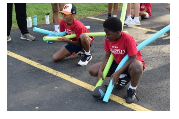
We had so much fun on field day!

Our students in Grades 7 and 8 have been involved