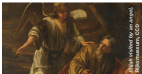
Elijah visited by an angel

August 11, 2024 | Nineteenth Sunday in Ordinary Time